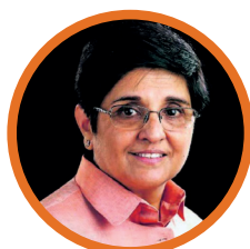
Dr. KIRAN BEDI

IPS (Retd.), Former Lt. Governor Puducherry