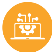
IT & Resource Centre