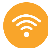
Wi-Fi-enabled Administrative Block