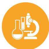
Laboratories: Sciences, Mathematics & Home Science