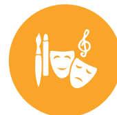
Activity Centre: Music, Art & Dance Studios