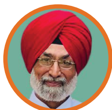
LT GEN SPS DHILLON