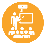
The Academic Block