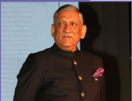
CHIEF OF ARMY STAFF GENERAL BIPIN RAWAT (UYSM, AVSM, YSM, SM, VSM, ADC)

There are no shortcuts to hard work. One must accept failures as they are the source of motivation towards success. Children are the future of this country and they must take the right path.